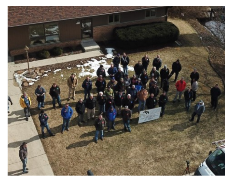
Education House from a "Bird's Eye View" (aka Drone!)

To the left: Education House - Rotation Training