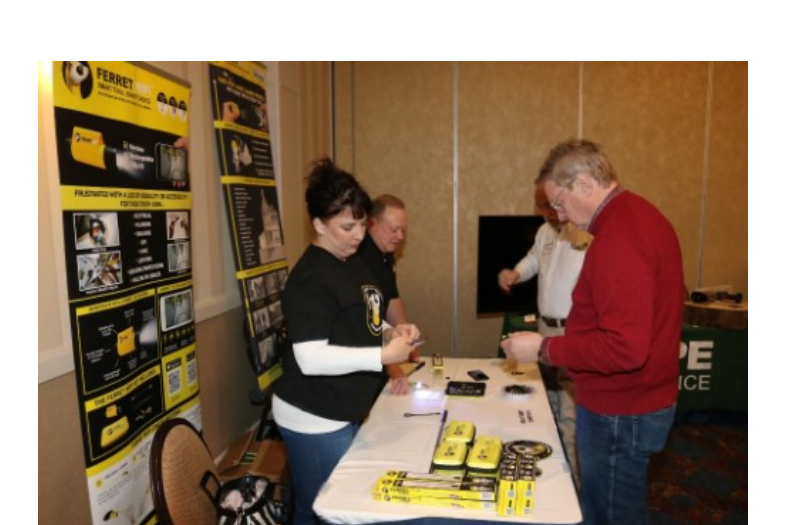
Cable Ferret/Ferret WiFi

Wow, wow, wow...is the perfect way to summarize our Spring 2020 Education House and Training Seminar! If you joined us, I am certain you would agree. If you didn't, let this be a lesson to you in the future... NEVER miss a WAHI event! The speaker lineup for Friday and Saturday was exceptional — and I do not use that term loosely! Our Vendor Room included a number of new companies, products and services! A BIG WAHI thank you to all who made it happen! It will be hard to top this one but don't you worry - the Education and Education House Committees are up for the challenge and are hard at work already. Mark your calendar for our Fall 2020 WAHI Education House and Training Seminar, November 13 and 14 in Stevens Point. (more pictures on page 5)