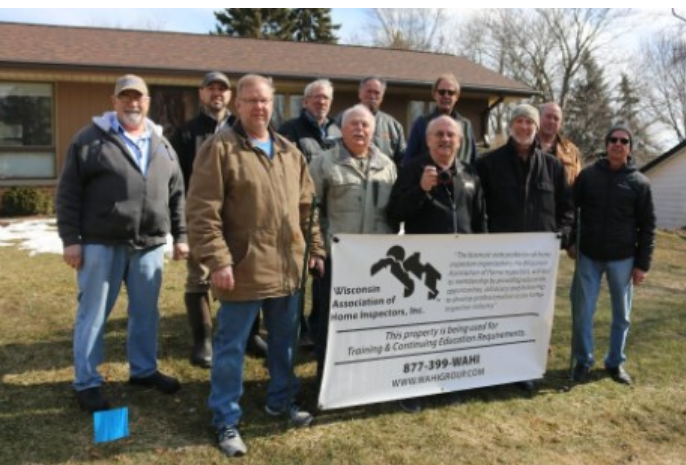
Education House Volunteers - THANK YOU!