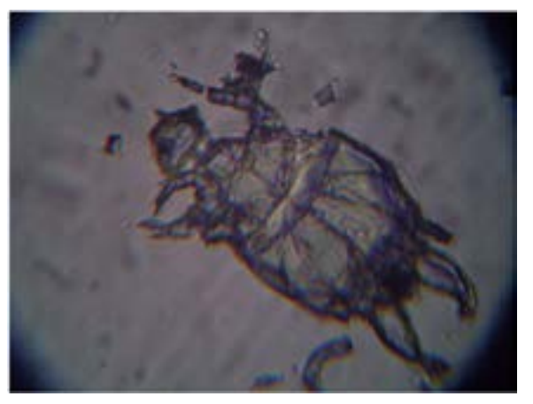
Dust mite carcass shown at 400X magnification

Every year we complete multiple air quality projects to identify why occupants experience adverse health reactions in their finished